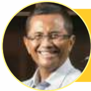
Prof. Dr (HC) Dahlan Iskan Professional