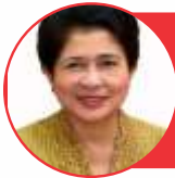
Prof. Dr. dr. Nila F. Moeloek, SpM (Minister of Health Republic of Indonesia)