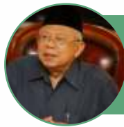
KH Ma'ruf Amin (Head of Indonesian Ulema Council)